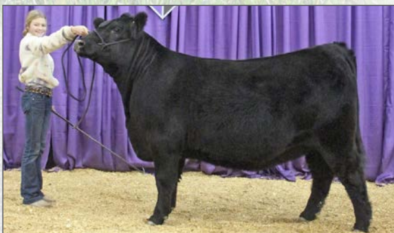
EG ISABEL 075 $34,000 Donor Dam of lot 13