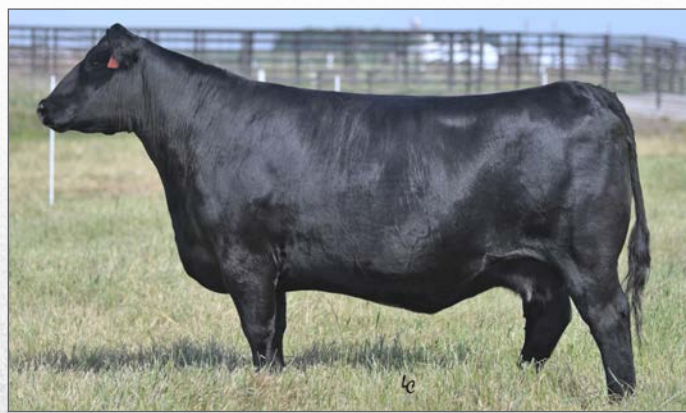
MISS BLACKCAP ELLSTON J2 Grandam of Lots 4-5, 19-23