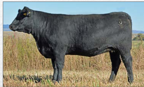
BALDRIDGE ERICA E167 $35,000 Grandam of lot 8