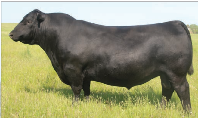
SAV RAINFALL 6846 Sire of 28-32, #19 for registrations in 2022