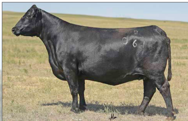
BALDRIDGE ISABEL B061 Donor Dam of 27