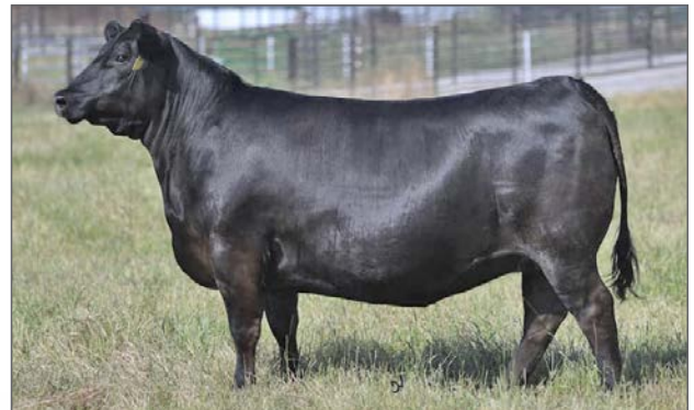
ERICA OF ELLSTON T220 Donor dam of Lots 11-12. See lot 1 for more great references!