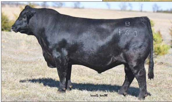
BALDRIDGE FORECASTER B160 $50,000 Full Brother to Baldridge Pratissa B177 at Alta Genetics and the sire of Versatile, Velocity, and Vortex.