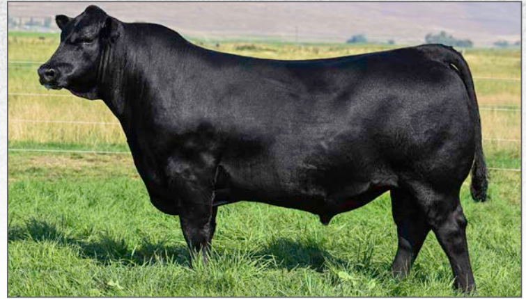
J TRADEMARK 1037