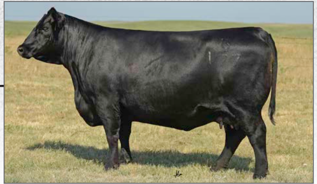
BALDRIDGE PRATISSA B177 See more info under lot 6!

LOTS 14-16 • RUGGED MADE BULLS WITH MUSCLE AND MARBLING!