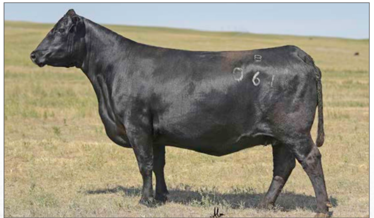
BALDRIDGE ISABEL B061 Donor Dam of 3, 24, 25, 27, 42-43

THE 2S COMMITMENT “ PRODUCE CATTLE WITH GOOD STRUCTURE, EYE APPEAL, AND DOCILITY THAT EXCEL IN ECONOMICALLY IMPORTANT TRAITS DOCUMENTED THROUGH PERFORMANCE MEASUREMENT OUTCOMES. ”