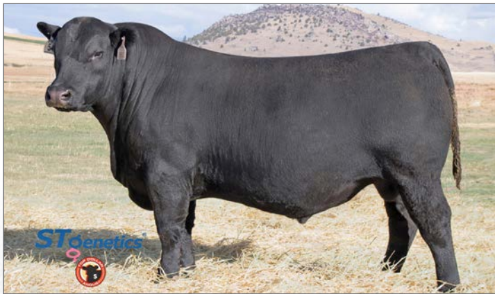
SITZ INTUITION Sire of lots 42-43