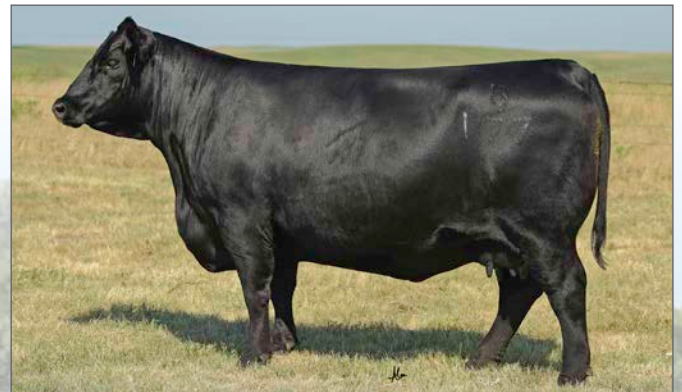
BALDRIDGE PRATISSA B177 Donor Dam of 6-7, 14-16, 28-33, 45-46, 49