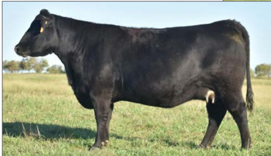
GMC BLACKCAP ELLSTON J2 2002 Donor Dam of Lots 4-5, 19-23