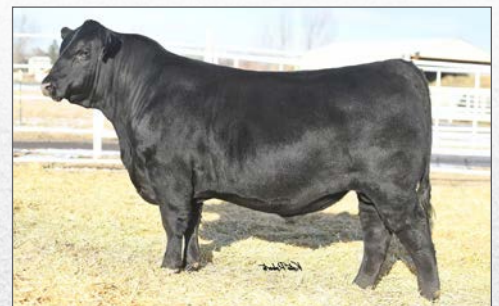
BA7 OAKS BOLD RULER Full Brother to the Dam of Lot 1 at Alta Genetics