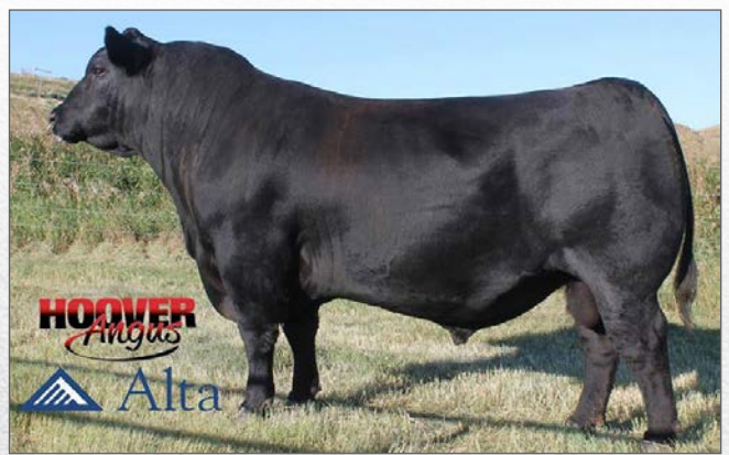
HOOVER NO DOUBT Maternal brother to Donor Dam of Lots 4-5, 19-23 and major influencer on power and performance.