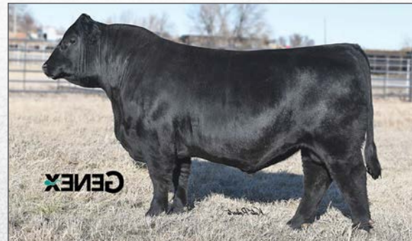
EG EYES ON YOU Maternal brother to dam of lot 13 at Genex