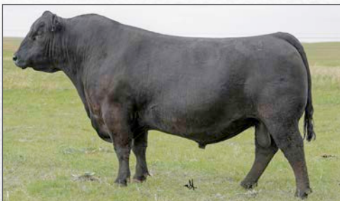
BALDRIDGE PAPPY Sire of lots 39-41