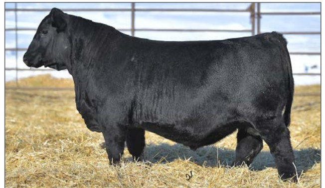
ELLINGSON DEEP RIVER Sire of Lots 24-25 at Alta Genetics