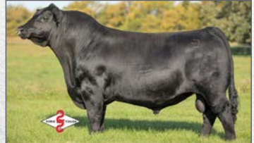
BALDRIDGE GIBSON Maternal Brother to lot 3, leased to Select Sires.