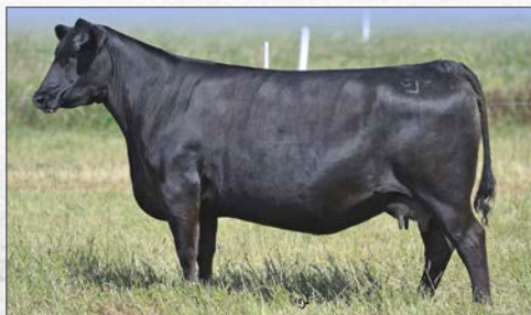
BALDRIDGE ISABEL E123 Donor Dam of lots 39-41