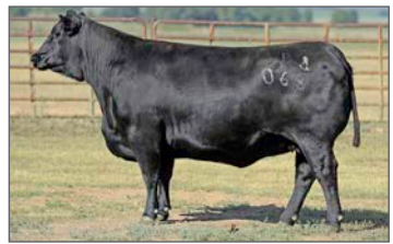
BALDRIDGE ISABEL B068 Full sister to lot 3's dam