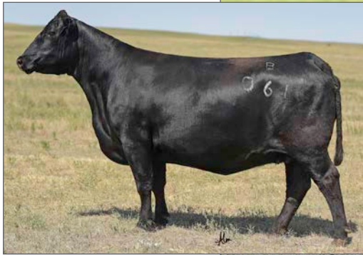
BALDRIDGE ISABEL B061 Donor Dam of 24-25