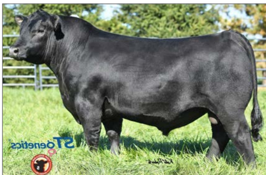
MYERS FAIR-N-SQUARE #10 for registrations in 2022, for good reason! These bulls are dense made and wean heavy.