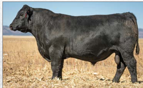
RRR FREE STATE $26,000 son of E167 owned by Amdahls, SD