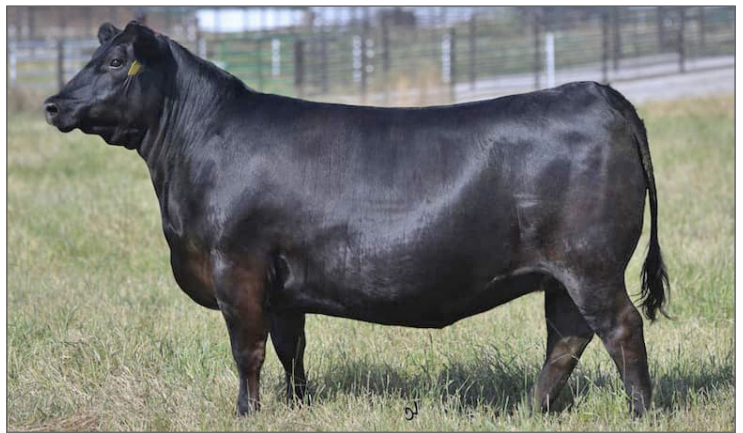
ERICA OF ELLSTON T220 Grandam of Lot 1

There is little to be said that can impress more than her photo, pedigree and EPDs. Buy a donor here!