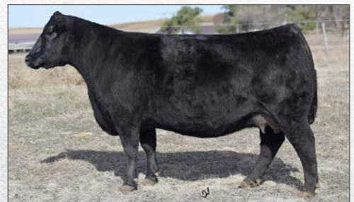
BALDRIDGE ISABEL A030 Granddam of lots 39-41