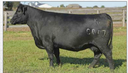
PINE VIEW BURGESS C067 Donor Dam of lot 9