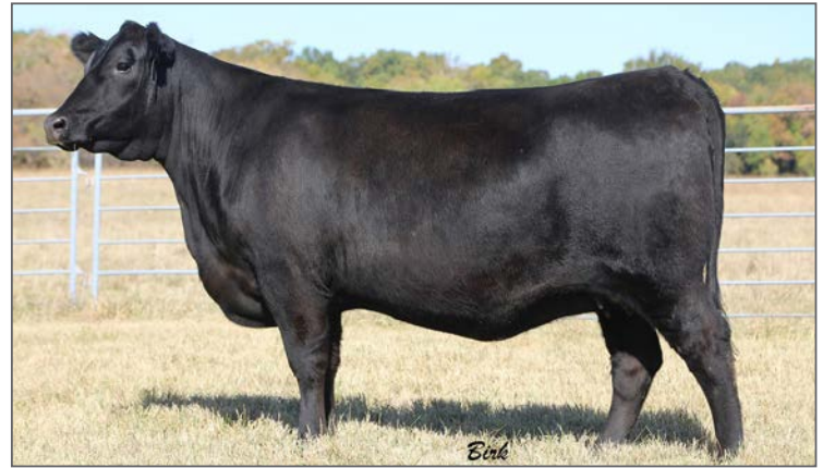
2S ERICA OF SENECA H4