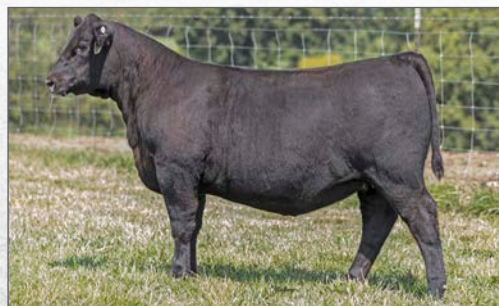
GALAXY ERICA 2953 $25,000 Daughter of J01