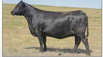
BALDRIDGE ISABEL B061 Donor dam of lot 3