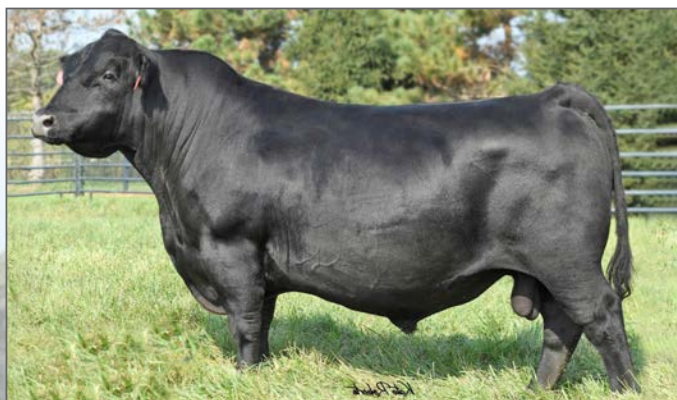
POSS RAWHIDE Sire of Lots 26-27