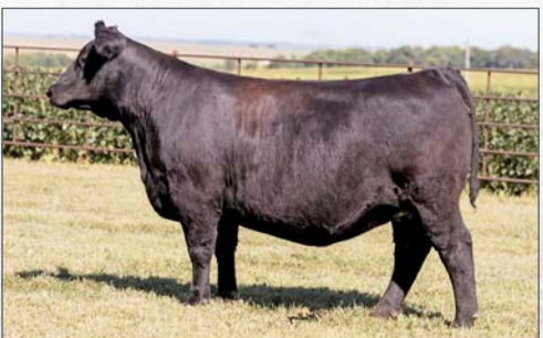
BA7 OAKS ERICA J01 $74,000 Valued Maternal Sister to Lot 1's Dam